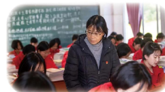
A1: The Central Propaganda Department awarded Zhang Guimei, the principal of Huaping Girls' Senior High School in Lijiang City, Yunnan Province as a "Model of the Times". Learn more about her in A1.