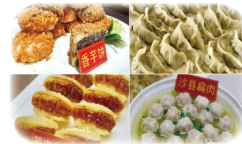
B1: Two of the most popular delights from Shaxian county, Sanming city, are noodles boiled in bone soup served with peanut butter, along with wontons(云吞) filled with juicy meat in a sizzling soup.