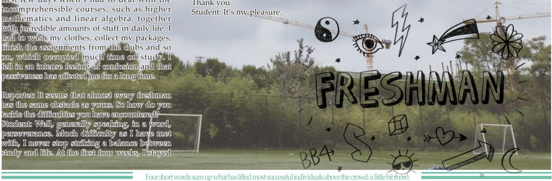
Four short words sum up what has lifted most successful individuals above the crowd: a little bit more.

Reporter: Sounds great. So what about the pursuing and exploring? Student: Up till now, I have not set up a specific aim for myself yet. Still, there has not been an idea for what I am interested in and want to study further. Therefore, I never stop exploring and pursuing what I'm truly devoted to. And anyway, I hope I can find what I really love some day. Reporter: I hope so. Wish you a bright future. Thank you. Student: It's my pleasure.